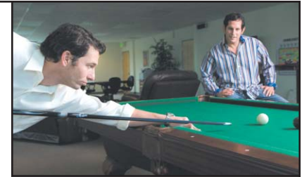
Local contractors working to revive San Diego Sockers